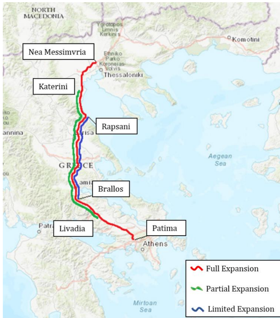
Figure 1: Simplified scheme of the proposed expansion projects

The assessments described above collectively resulted to the projects presented next. Thus, the capacity created by the said projects includes the creation of incremental capacity at Kulata/Sidirokastro IP, along with other points of DESFA. It is noted that in the final assessment for the determination of the appropriate Expansion Project (if any) and the Economic Viability Test (EVT), Kulata/Sidirokastro IP will be assessed together with other points of the NNGTS which are part of DESFA's Market Test.